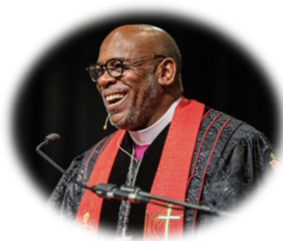
Bishop Holston Alabama-West Florida Conference Proud Member of United Women in Faith