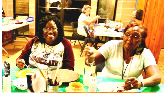
A record number of first timers!