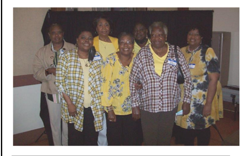
Chapel local unit with the most women in attendance