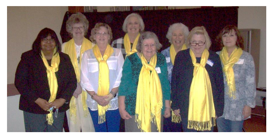
Dalriada Local unit hosted Annual Day