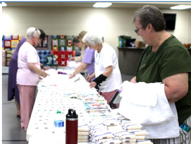
Assembling UMCOR kits