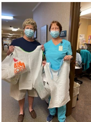
Bib Project: We have made 30 bibs for our local nursing home.