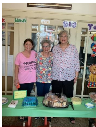
Unit provided lunch for teacher appreciation at the school

Because the contact list of prospective members was so successful last year, we will repeat that this year also. We are very encouraged by the interest of our members. We are fortunate to have everyone willing to volunteer to present a program from our program resource book and to provide refreshments at our meetings