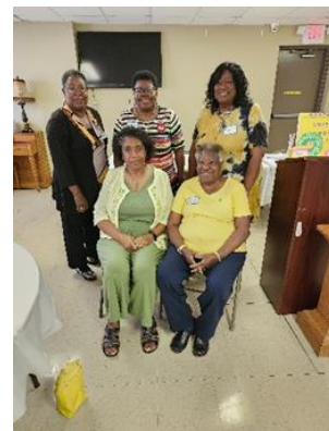
Chapel United Women in Faith – Unit with the most in attendance.