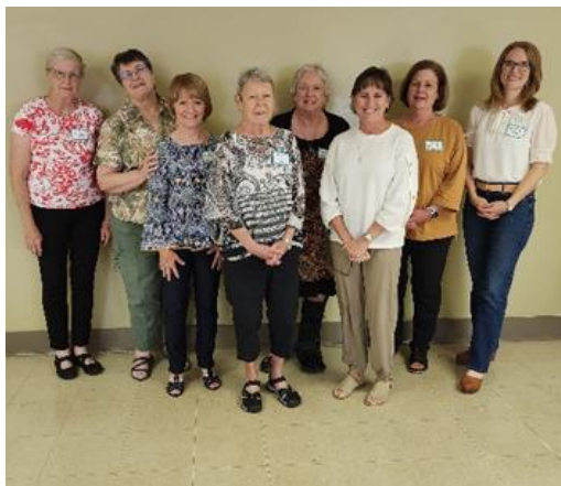
Host Unit United Women In Faith- Clanton 1 st UMC