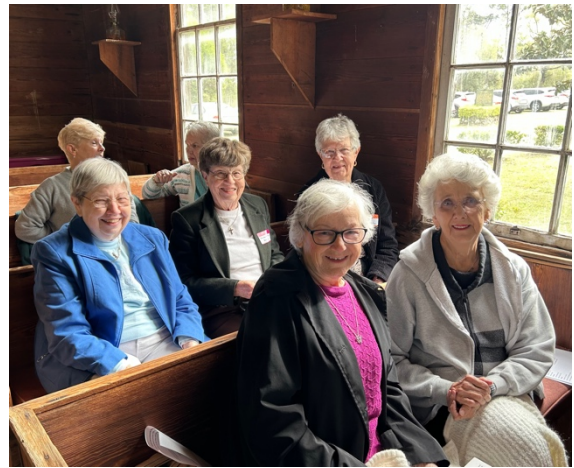
Members From Bonifay