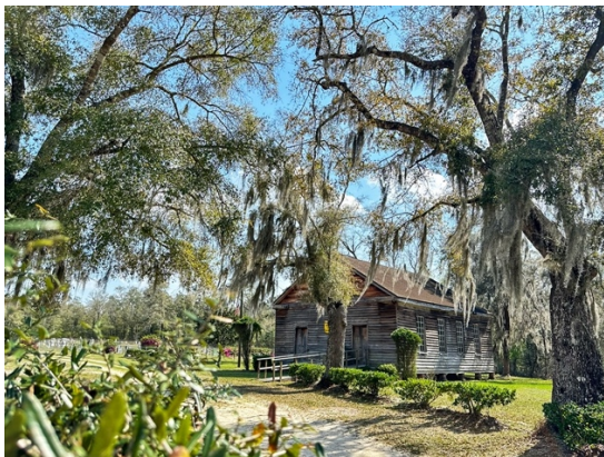
Moss Hill Methodist Church, Vernon, FL