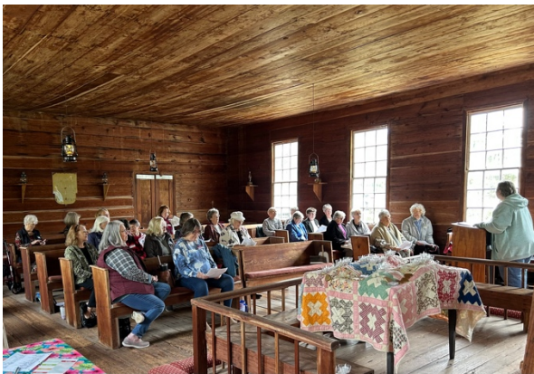
Members & Guests of UWF Marianna, Panama City, and Dothan District