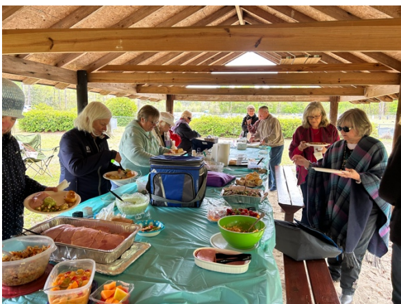
Ladies getting their lunch!