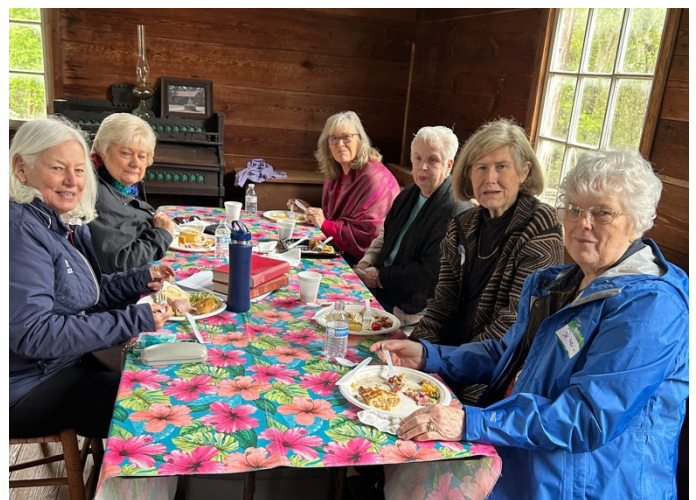
Ladies enjoying their lunch!