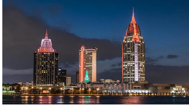
Mobile Alabama Skyline

Give to them food, clothes, blankets, umbrella, a UMW pen to write. This does make a difference. As you give whatever... Give a bible verse with it... to nurture! You have one chance at showing you care. Remember your UMW... invite! You are in the Lord's army!! God cares. You can make a difference this year! Let us all do this! Always remember to pray, listen, pray again. New beginnings... make a difference this 2020.