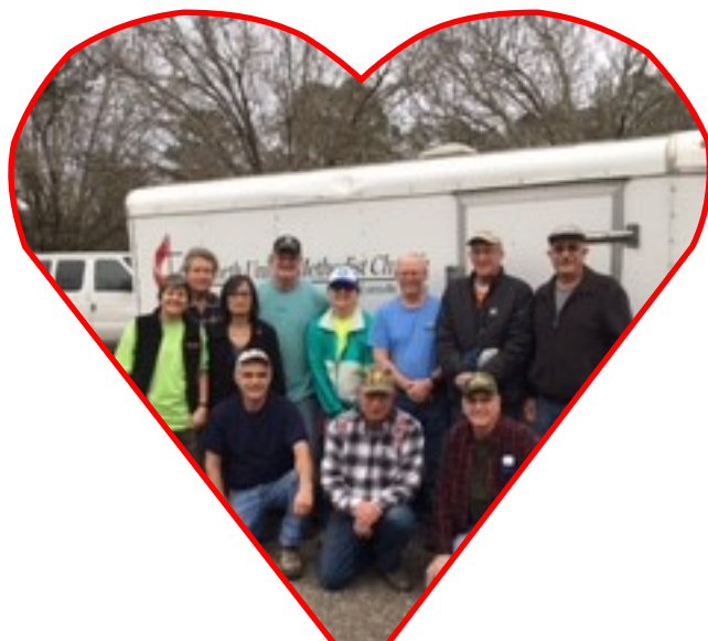
EVANSVILLE, INDIANA TEAM