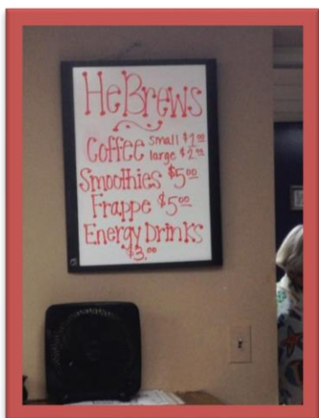
A sign in the Coffee Shop @ Lovelady Place