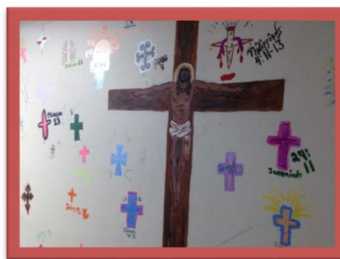
One of many colorful halls that residents have decorated themselves.