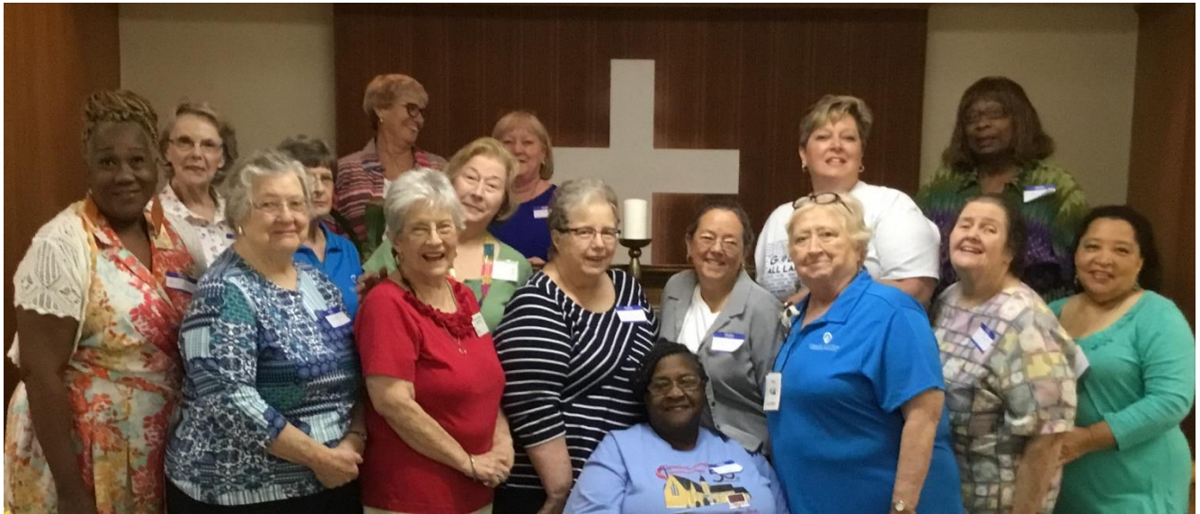
Mobile District Mission Team at the President's Training Session