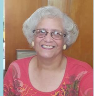
Education and Interpretation Coordinator

Each year, United Methodist Women members prepare for faithful living and action by studying mission studies. Mission studies are offered each year - a