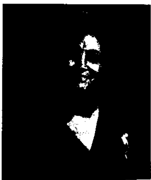
From the desk of the President...

The organized unit of United Methodist Women shall be a community of women whose PURPOSE is to know God and to experience freedom as whole persons through Jesus Christ ; to develop a creative, supportive fellowship ; and to expand concepts of mission through participation in the global ministries of the church .