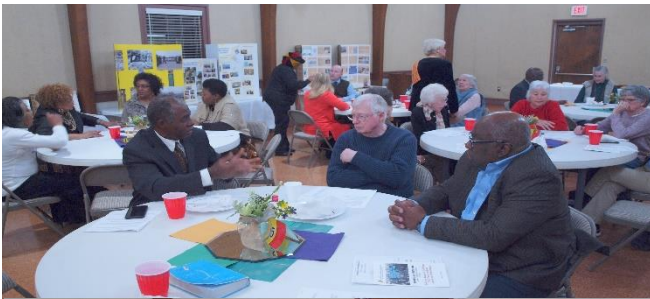
Table Breakout discussions