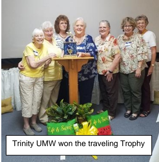
Trinity UMW won the traveling Trophy