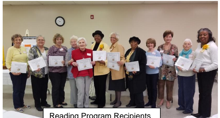
Reading Program Recipients