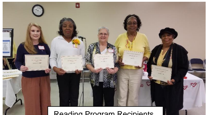
Reading Program Recipients