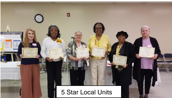
5 Star Local Units