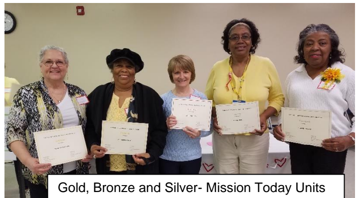
Gold, Bronze and Silver- Mission Today Units