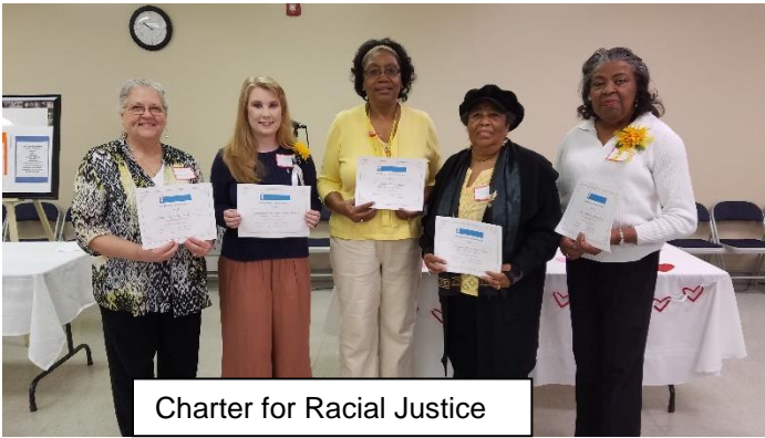
Charter for Racial Justice