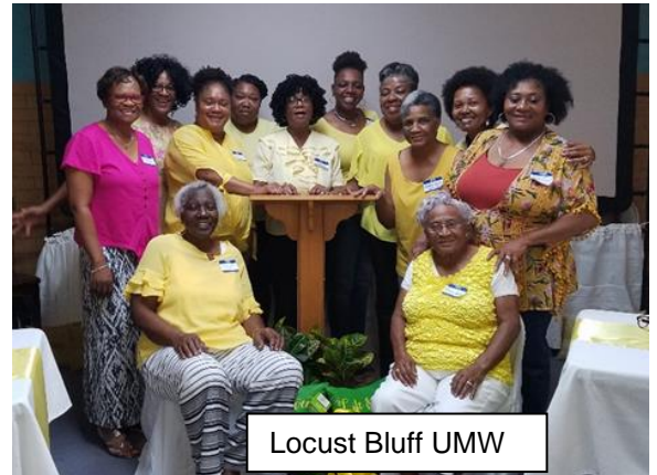
Locust Bluff UMW