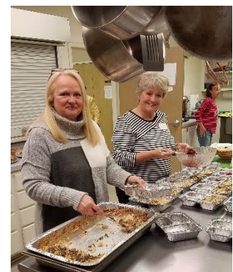
Millbrook Outreach Ministry preparing meals for the community