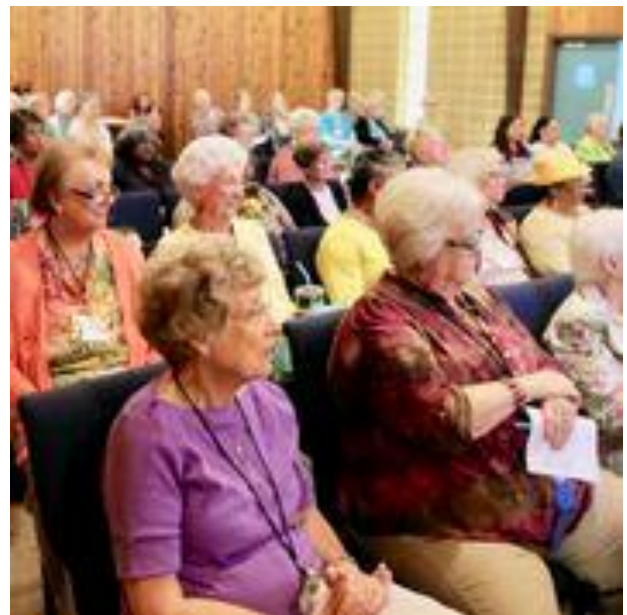
Conference Spiritual Enrichment Retreat at Blue Lake Assembly Grounds