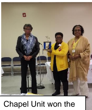
Chapel Unit won the traveling Trophy for Most Attendance