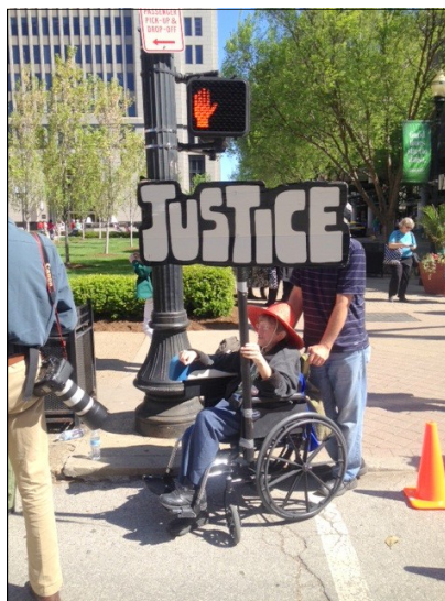
Marching for economic justice in Louisville