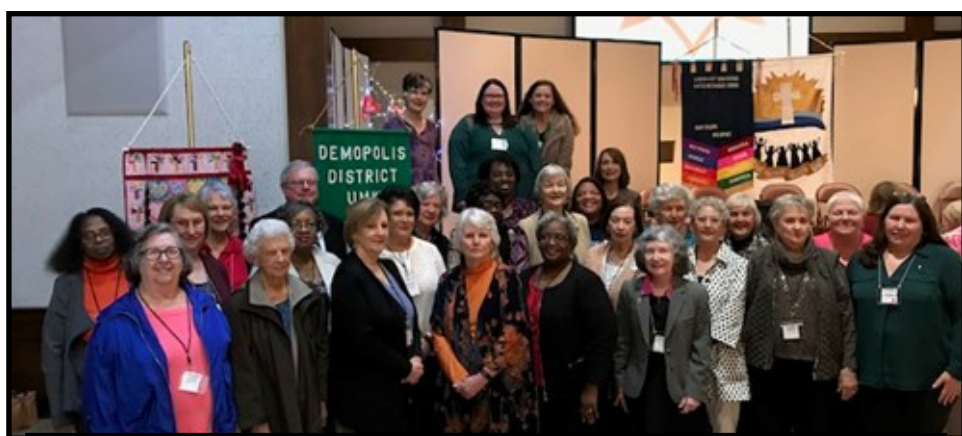
Group in attendance for Annual Day